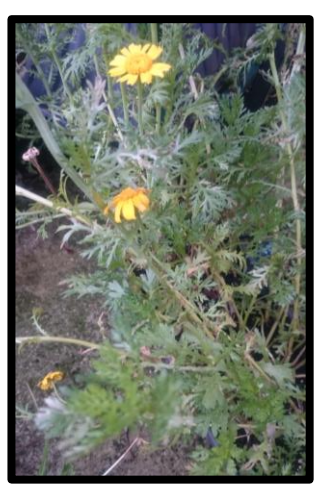
Jane's Chop Suey in Flower

A hardy grey-green kale that has a profusion of tender shoots in spring. While you can take leaves to eat as you would with any kale, this variety has particularly sweet tasty sprouts in spring, like a green version of sprouting broccoli.