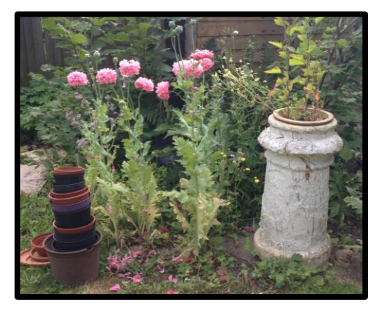
Josie's beautiful Pink Poppy

These poppy seeds can be used in bread or cakes.