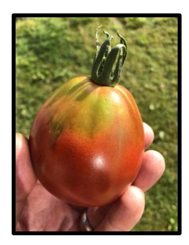
Richard's Black Trifele

Small, really prolific black cherry tomato. Small, sweet and good tomato flavour. Tendency to split after picking. More purple than black!