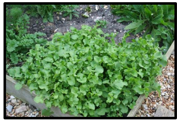
Buckler - leaved Sorrel

It has a vibrant, lemony taste, and a soft texture so it works well as a salad ingredient or as an herb to flavour fish and egg dishes.