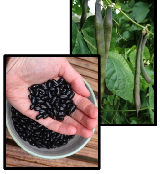
Cherokee Trail of Tears