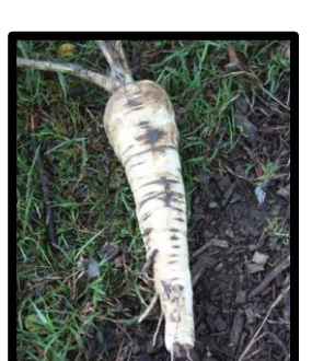
Thinning from Thrupp parsnip

Generally, the parsnip produced is quite large and well-shaped but some seeds have been known to produce miscellaneous results.