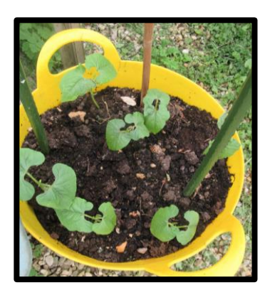
Fran's Bridgwater Bean

It's proving really popular with our seed guardians; we will be putting extra focus on saving greater numbers of this bean in 2020.