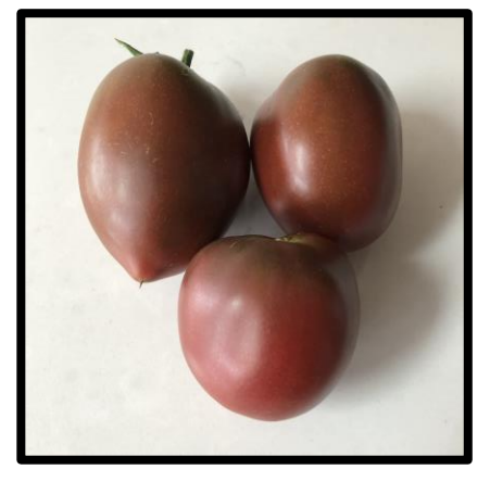
Richard's Purple Ukraine

An early outdoor variety with excellent standard size red fruits.