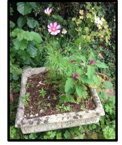
Josie's Pink Cosmos

A fantastic colourful perennial. daisy-like flowers will attract pollinators such as butterflies and bees into the garden as well as being a great addition to a cut-flower display to be enjoyed within the home. Reaching a mature height of 1.2 metres, they will flower from July through to October.