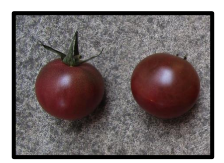
Margaret's Black tomato

Medium-large sized beefsteak tomato that is lightly ribbed with a flattened globe shape. The flesh is juicy and meaty with minimal seeds, and it offers a savoury tomato flavour with subtle tartness, as well as a hint of sweetness. The Marmande is an early-ripening variety, and the strong, semi-determinate bushy tomato plants grow upright and often need support as they produce clusters of the large scarlet-red fruits.